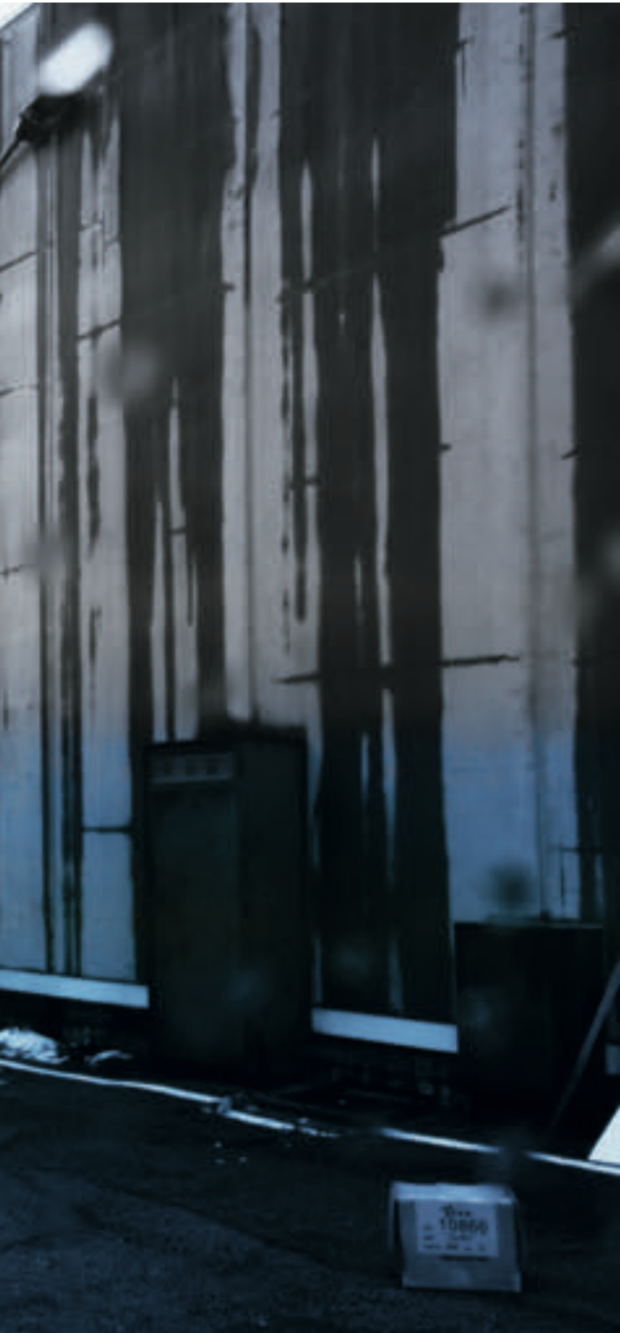
Varziela